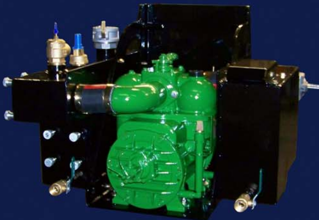
MECII Series Max Pak