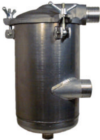
10 Gallon Capacity 3" or 4" Connections