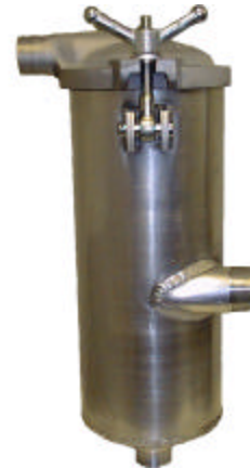
4 Gallon Capacity 1.5" or 2" Connections

Our Moisture Traps Protect Any Pump up to 600 C.F.M.